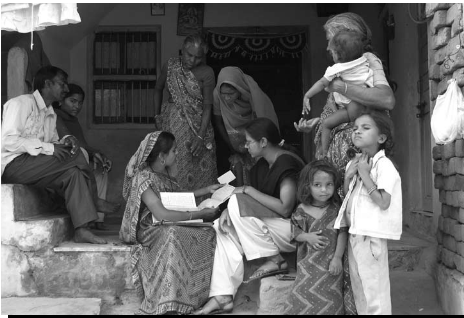
Consultation with a family of informal workers in India.

Much like formal counterparts, informal workers and enterprises are experiencing decreasing demand for goods and services, rising cost of inputs, and increasing pricing volatility for goods sold. In contrast to formal workers, informal workers are experiencing increasing competition and swelling ranks of their trades. Contrary to conventional wisdom, expanding employment in the informal economy does not mean informal workers are thriving during the recession. Unlike some of their formal counterparts, informal firms and informal wage workers have no ‘cushion’ to fall back on and have little option but to keep operating or working through these economically challenging times.