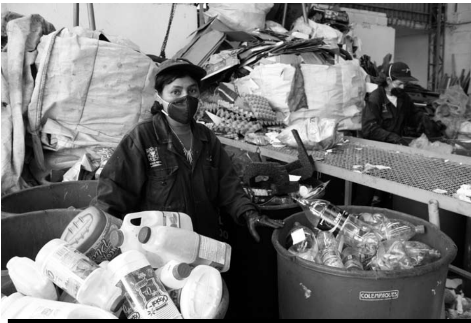
Waste picker sorting material at the Alqueria Recycling Centre in Bogotá, Colombia.

However, a higher number of informal workers does not mean they are thriving. On the contrary, respondents were clear that they faced greater absolute numbers of competitors for fewer customers over the same period, and this had decreased their revenue substantially. Of the street vendors, 80 per cent reported that they had experienced increased direct competition from new vendors selling similar goods. Over two-thirds (655) of home-based workers, who are most likely to work in isolation, reported increased direct competition. One home-based worker reported that she used to sell her products at 199 Baht (USD 6) but her new competitors were willing to sell as low as 59 Baht (USD 1.7) and she now faces a 50 per cent decrease in her income. Some of these new competitors were migrant workers who were willing to sell at the lowest prices.