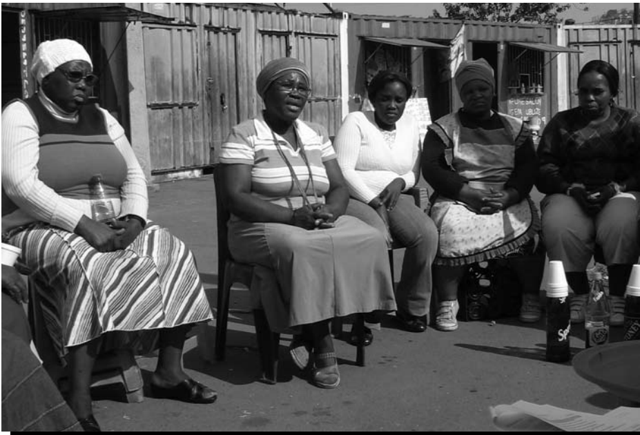
Street vendors voice their demands in Durban, South Africa.

Informal workers feel that there are a number of specific actions that governments can take to help alleviate their hardship during the crisis. Emergency measures such as soup kitchens or community kitchens will provide meals and food staples at subsidised rates to informal workers and their families, who are struggling to feed themselves. Likewise, workers demand that governments take action to ensure that children are not dismissed from school if their parents are struggling to pay fees during the crisis. Informal workers also propose that shelters are provided for those facing eviction, as well as new migrants internally displaced by economic crises.