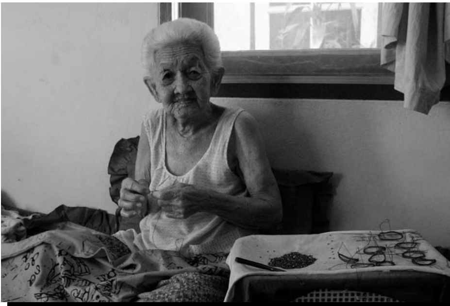
Sub-contracted home-based worker beading in Bangkok, Thailand.

of orders, and/or wages, depending on their employment arrangement with their workforce. In Table 3, more than half (55%) of the industrial outworkers – sub-contracted home-based workers – reported that their work orders had been cut and that the volume of their production had fallen significantly in the preceding six months. Work orders were fewer, and smaller, and in some cases, workers were not being paid on time for their work. One respondent in Thailand reported that her employer had not paid her at all in the previous six-month period. Another reported, "I used to get orders for slippers from Phuket and Sa Mui, about 600-800 pairs. Now I have no orders so I have to produce and sell by myself." 9