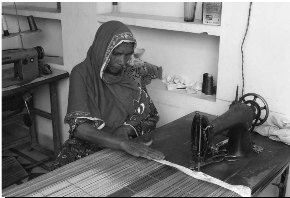
Home-based worker making reed mats in Kasur, Pakistan.

The current global economic crisis has hit the global workforce very hard and few economic actors have been insulated from the shocks. Initially, media and policy attention was confined to analysis of the global financial sector and the macroeconomic situation. Attention has now turned to the impact of the crisis on the real economy in both the developed and developing worlds, and many are concerned that the crisis could gravely afflict emerging markets and developing countries, effectively destroying the economic progress of recent years. The developing world is home to a major proportion of the global poor, for whom the consequences of the crisis could be especially severe, given their slim margins for survival in the best of times. 1 And yet, as the crisis transformed into a recession, and the recession spread across borders, the informal economy has remained largely absent from public and media attention. This is a particularly glaring omission given that a majority of the world's poor and vulnerable workers rely on the informal economy as a source of employment and income.