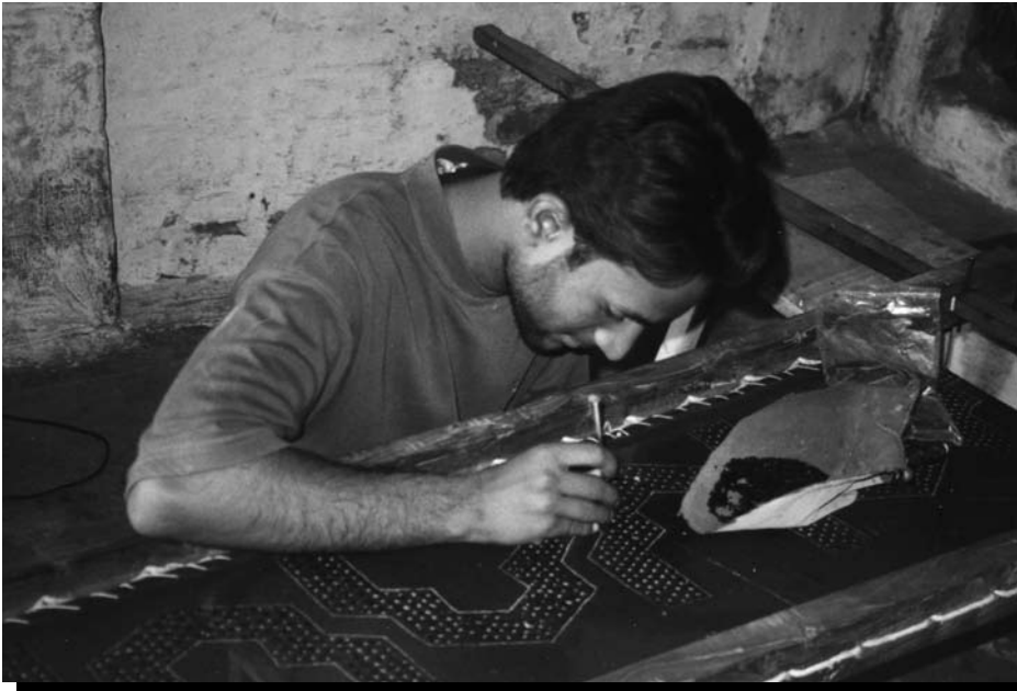
Own-account home-based worker doing needlework in Ahmedabad, India.

workers. Laws that recognise organisations vary considerably from country to country. The first step is the need to recognise the existence and importance of member-based organisations of informal workers by all levels of government but also by international bodies like the International Labour Organisation.