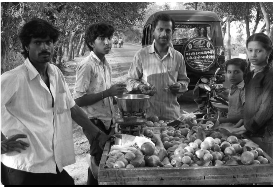
Street vendors selling their produce in Ahmedabad, India.

Individual waste pickers are the most vulnerable as they do not have any supportive organisation or network to turn to. In Pune, waste pickers participating in this study are involved in highly organised waste-recycling schemes and some sell waste through their own co-operative. 48 The drop in prices of various recyclable goods reported by these respondents ranged from five to seven per cent. In Latin America, where a lower percentage of the sample was involved in these kinds of recycling schemes, the drop in prices of various recyclable goods over the same period ranged from 42 to 50 per cent. Whether this contrast is due to the level of organisation remains an empirical question that needs further investigation.