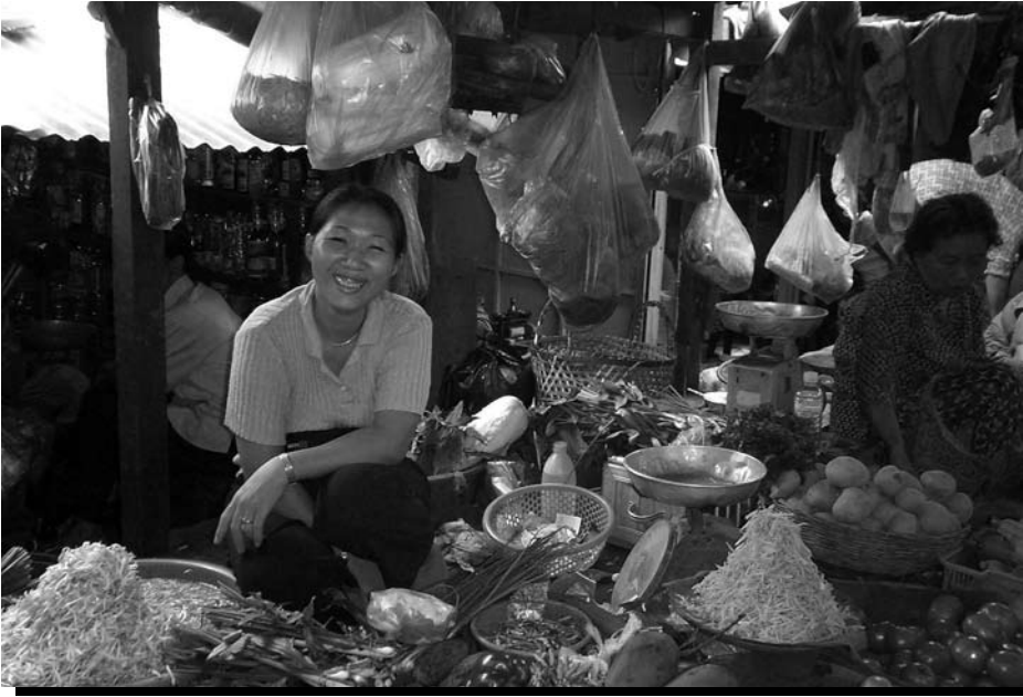
Street vendor selling food at a stall in Thailand.

Finally, special thanks are due to the 164 informal workers who participated in this study. The project partners and coordinator are deeply grateful to them for their time, their contributions, and their candour.