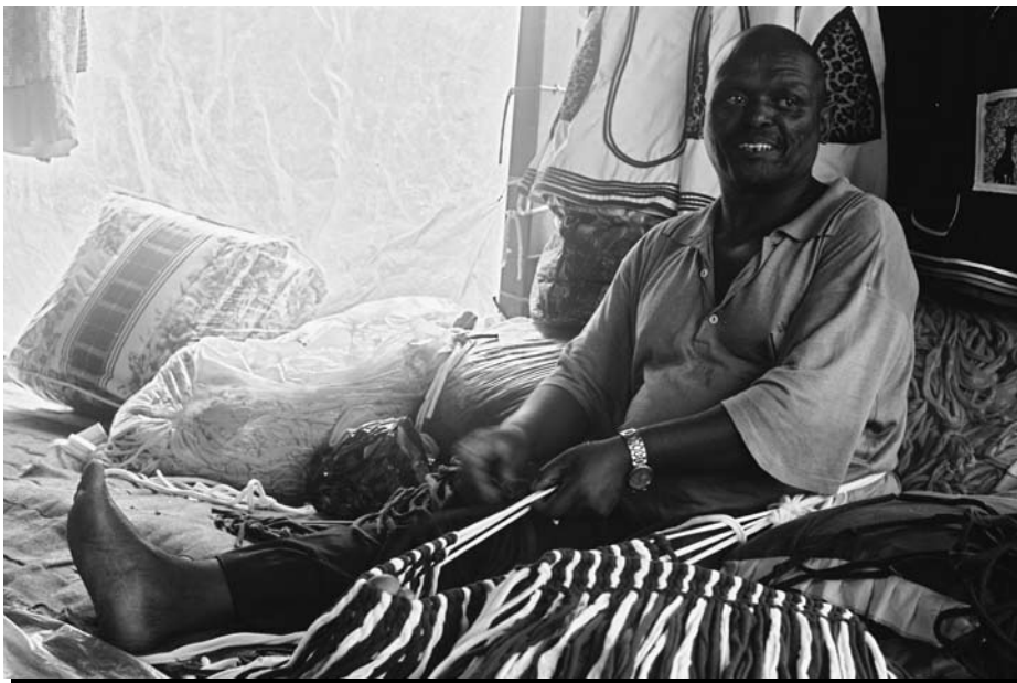
Street vendor preparing his goods in Durban, South Africa.

waste recycler felt that he and other waste pickers were victims of a global “game”, and that entrepreneurs were “playing” with the price of waste materials. The feeling that they were being subjected to forces beyond their control translated into a sense of powerlessness among some workers. A waste picker in Bogota revealed, “My feeling is frustration... Much more effort is required every day to get a result that is much lower than what it was previously. Very little can be done.” 62